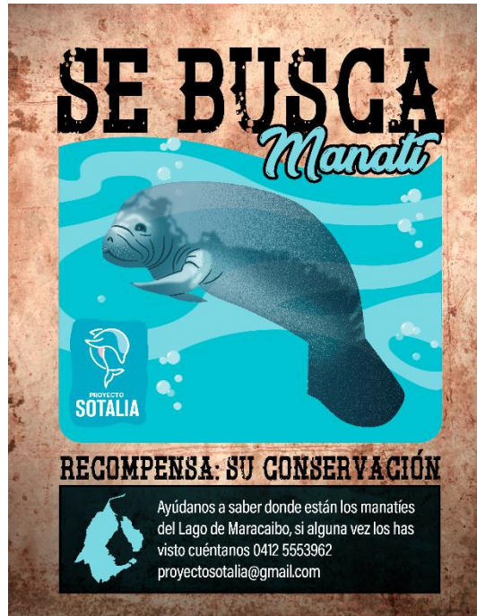
Image 1. Information search campaign through social media about manatee observations in Maracaibo Lake with the support of citizen science.

About local support from fishermen in specific locations, thanks to their active participation we were able to report 4 manatee sightings in the south of the lake (2 en August, 1 September, 1 October) and observation of Guiana dolphins. They reported of 3 bycatch events of the Guiana dolphin in the south of the lake and exploitation of the animals was confirmed.