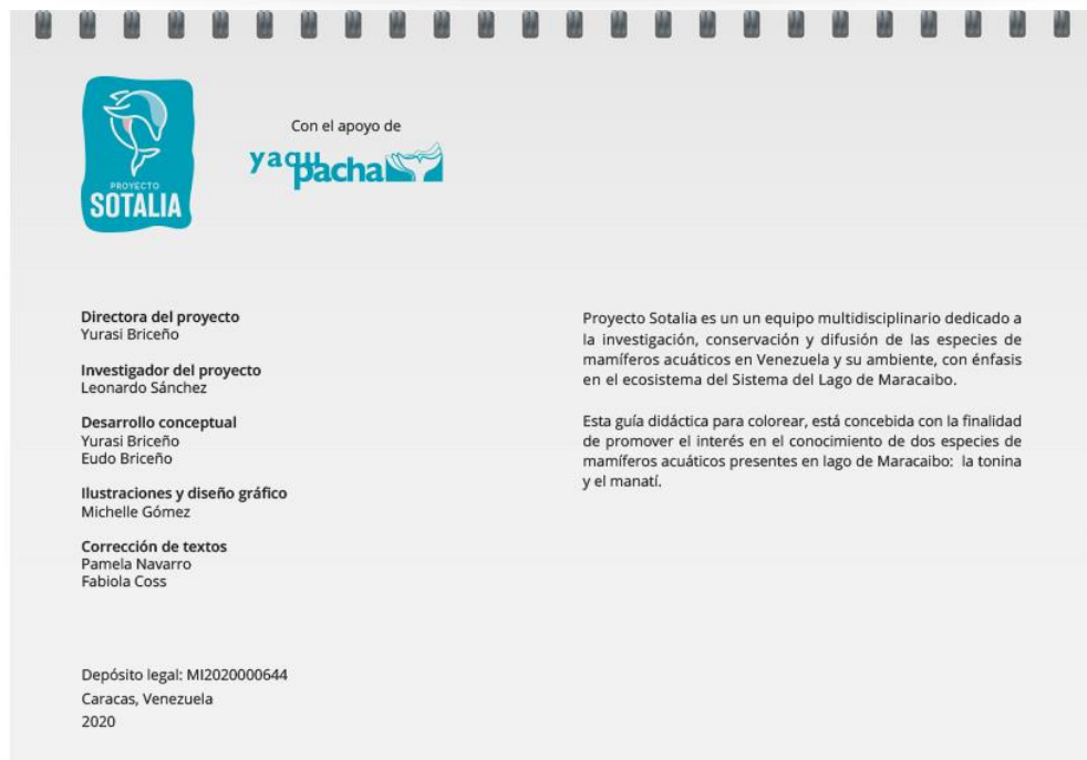
Image 2. Primer/story about Guiana dolphin and manatee in the lake Maracaibo System.